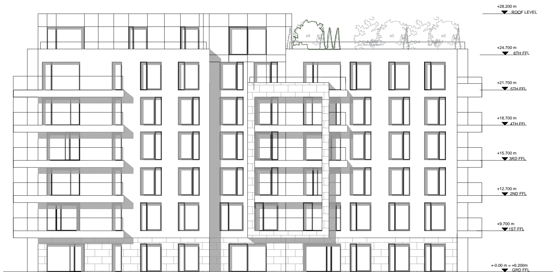
1 PROPOSED BLOCK 4 & 6 - GARDEN ELEVATION 1 : 200